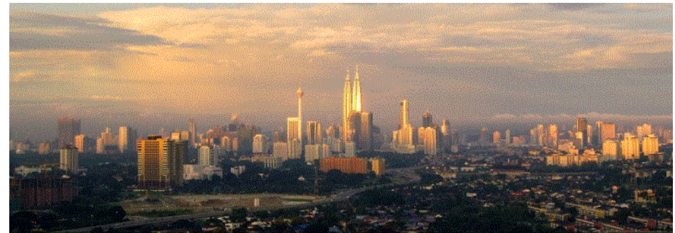
*all views are actual site photos

Puncak Ukay & Ukay Bayu apartments is a sensitive but comprehensive redevelopment and upgrading of just 89 free-hold, extremely low density apartments to modern luxury standards.